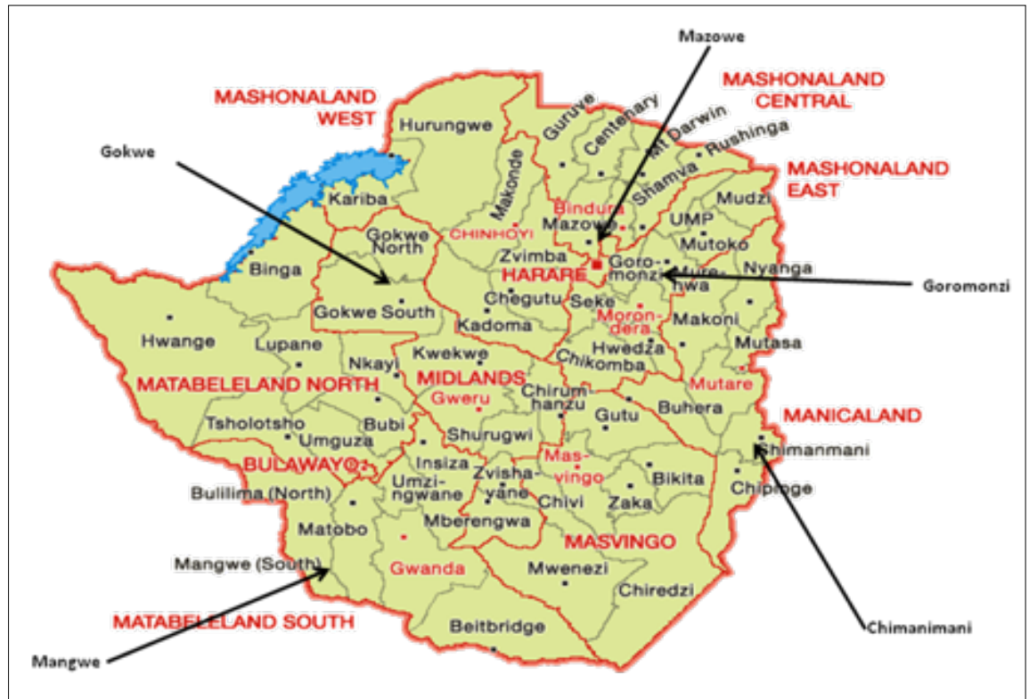
Figure 1. Map of Zimbabwe

and two life histories. This was enhanced with interviews with key informants at district level. In addition to this fieldwork, national level interviews were conducted with various stakeholders based in Harare. Among these were key ministries, farmer unions and other stakeholders (See Appendices). A comprehensive desk review was undertaken and this assisted in establishing a clear understanding of status of girls in agriculture in Zimbabwe. The secondary data collected and analysed includes but not limited to policy and programme documents, project documentation, internal and external reports in government, analysis of legal documents e.g. Agricultural related legislations, Rural District Councils Act, Traditional Leaders Act, Communal Lands Act, among others.