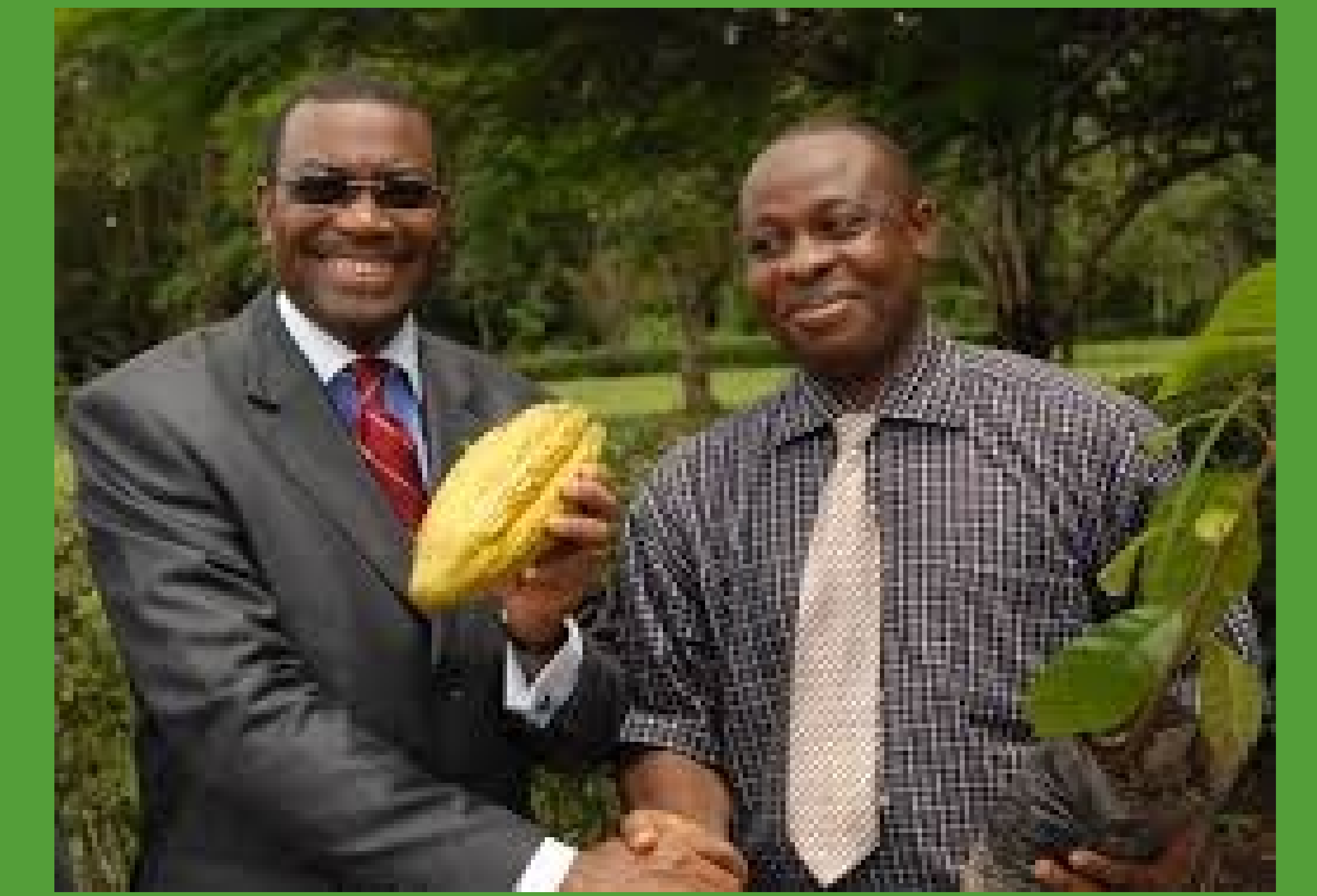
Plate 4: Minister of Agriculture, Dr. Adesina holding a hybrid cocoa pod developed by scientists in the drive for revitalizing the Nigerian cocoa industry.

Conclusion Post structural adjustment era witnessed several agricultural interventions which has changed agricultural land scape and food security in Nigeria