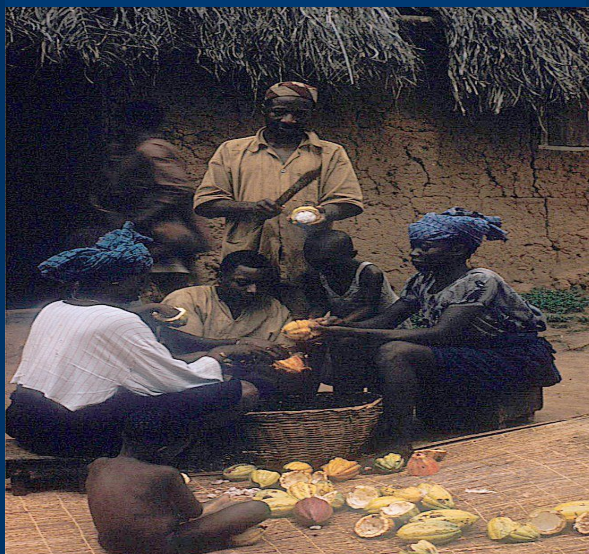
Plate 1: Cocoa in Pre-independence

During the 19 th century, Nigeria's agricultural economy was self-sufficient in food and produced several export commodities like cocoa.