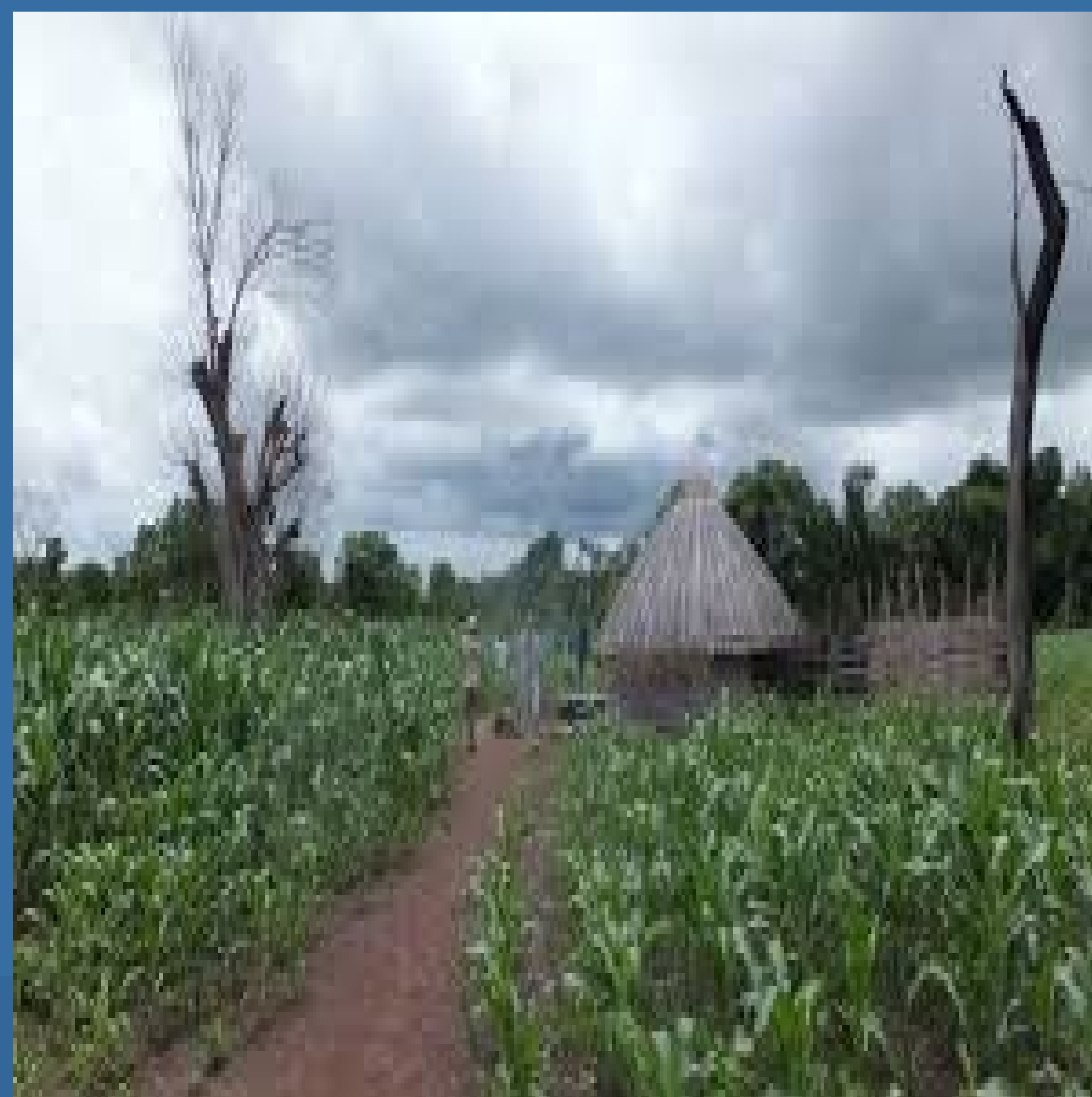
Plate 2: Land use in Nigeria