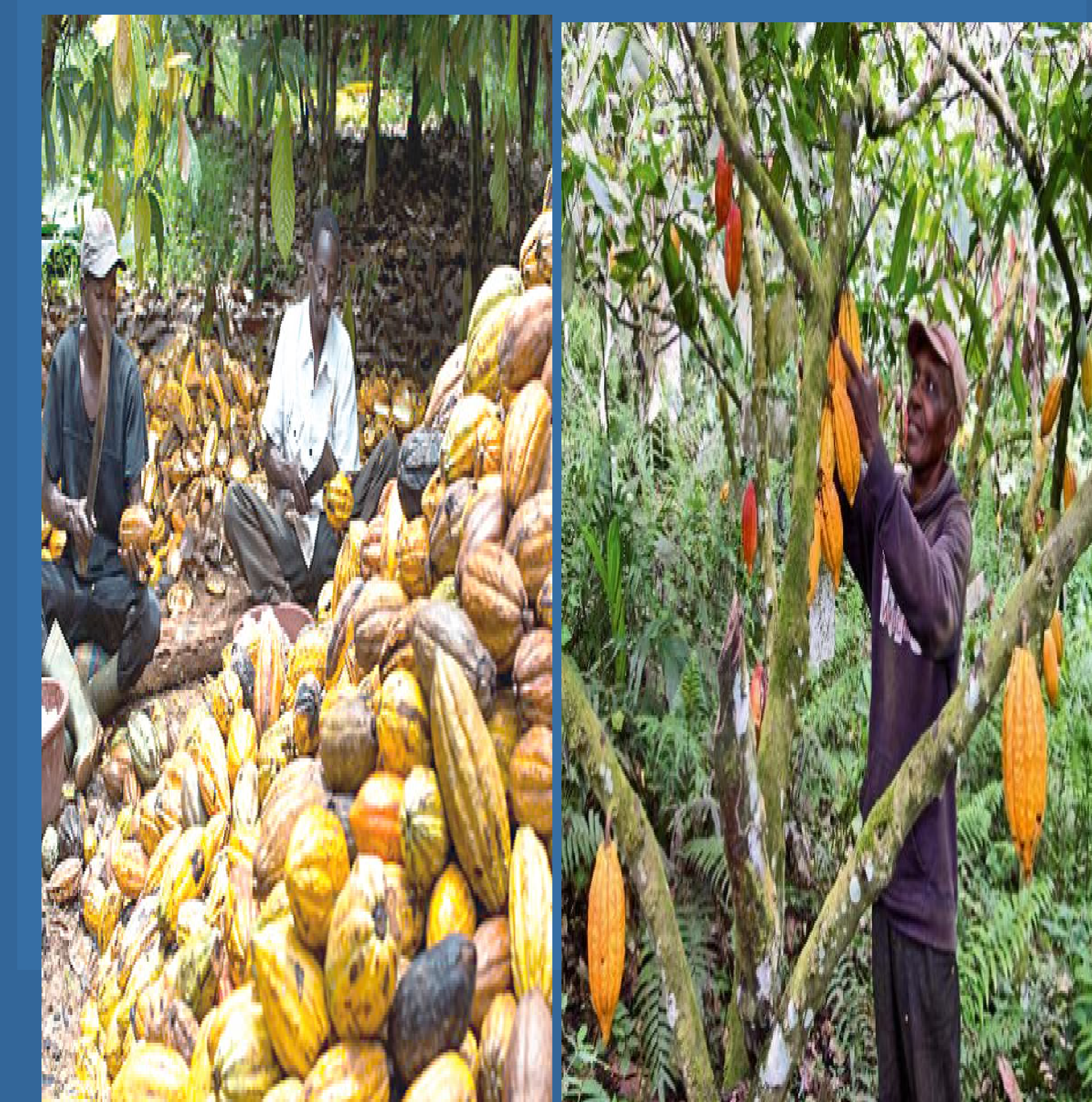
Plate 5: Land and Labour use in colonial era