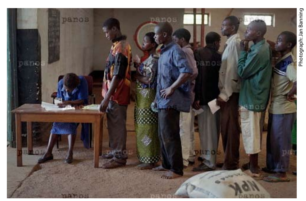
A queue of people at a point of sale for state-subsidised maize and fertiliser.