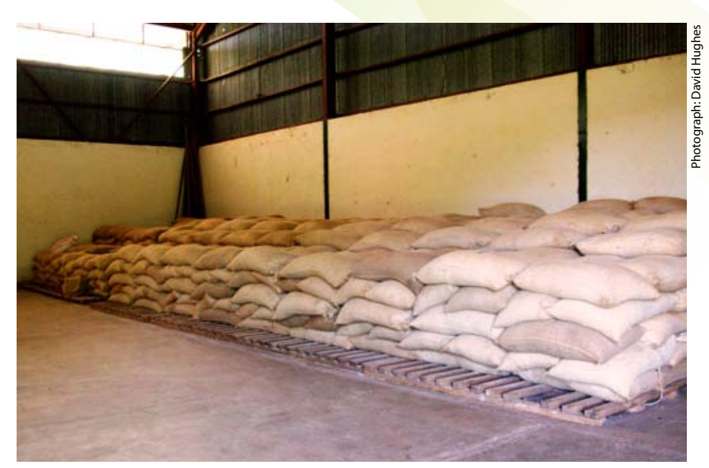
Urea fertiliser stocked ready for distribution.

forecasts that over the next 10 years both food and fertiliser prices will fall back to their 2007 and 2005 levels respectively. These models did not, however, predict the current high prices, and though rapid falls back to 2007 fertiliser prices are predicted for 2008/9, further price reductions will be much slower.