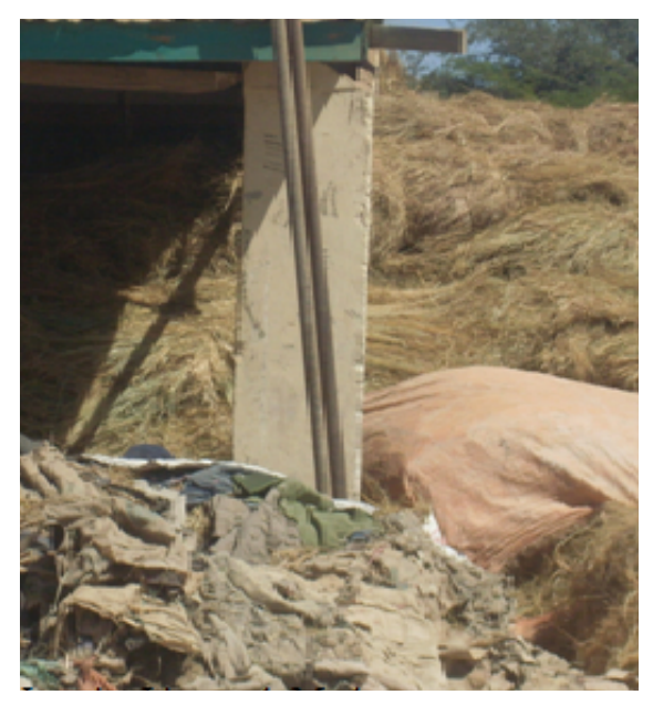
Pic 1: Fodder in Hargeisa Livestock Market

price by selling crops for livestock feed than waiting for the crops to mature. Second, long before the ban of the fodder trade, border grazing sites were privatized and hired out to livestock traders trekking livestock along the border. The price of hired grazing increased after the fodder ban.