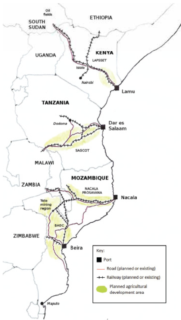
Figure 3: Location of the four eastern seaboard corridors

This section summarises the scope of each of the eastern seaboard corridors and describes their historical context. Detailed analyses and sources are available in work by Shankland, Gonçalves and Favareto (2016) for Nacala, by Kaarhus (2011) and Maennling, Shah and Thomashausen (2014) for Beira, by Jenkins (2012) and Bergius (2016) for SAGCOT, and by Browne (2015) and Mosley and Watson (2016) for LAPSSET.