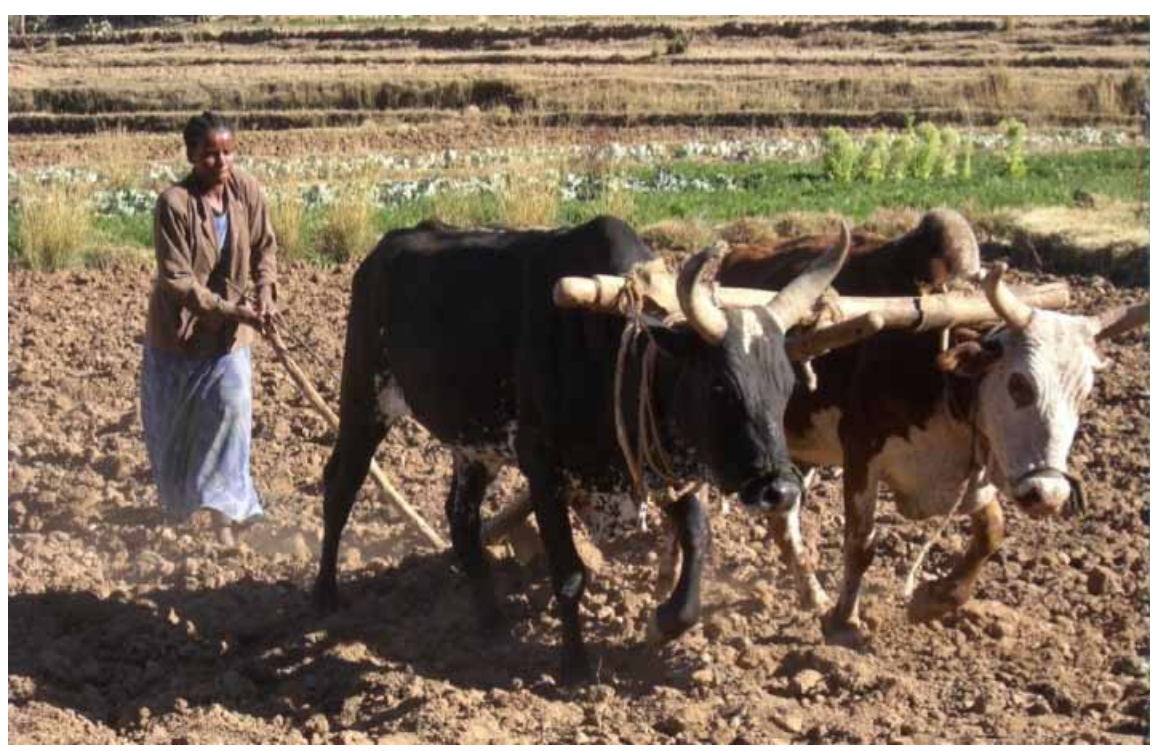
A young woman ploughing with oxen in Tigray.

There is this tradition that has been brought on from the past. For example, you will never see a man baking injera or cooking or a woman ploughing land or sowing seeds in the farm. It is just tradition but it still keeps men and women doing different things. (Female high school student, Chertekel)