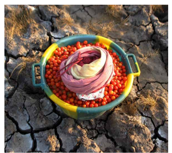
Figure 2. Women travelling to the local markets to sell their and/or their households' products.

farmers in the mangrove fields, before harvests' (a Nalu young man, 19.02.2013). They sell mobile phones and merchandise on credit to the Balanta before the harvests and then come back to collect the debt in rice. Also, the cashew traders that buy cashew nuts in the area are now buying the rice locally to exchange it for cashew nuts afterwards, taking advantage of the high rice prices in force at the time. This diminishes considerably the rice stocks available in the region for people who do not have cashew to exchange. During the cashew season, traders are only interested in cashew. If local people do not have sufficient rice stocks for the 'hunger period', even if they have other products or money, it is difficult to find anyone who has rice to sell or exchange.